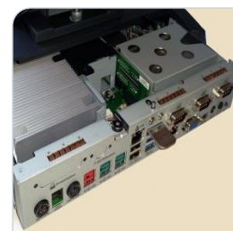
Slide in / out mother board

Specifications are subject to change without notice - © AURES 2016