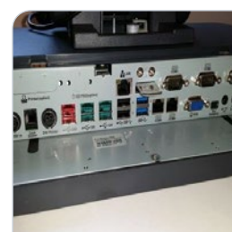
Extensive I/O ports