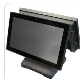
14.1 inch 16:9 LCD customer display