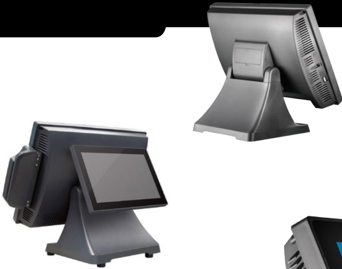
Dual screen system